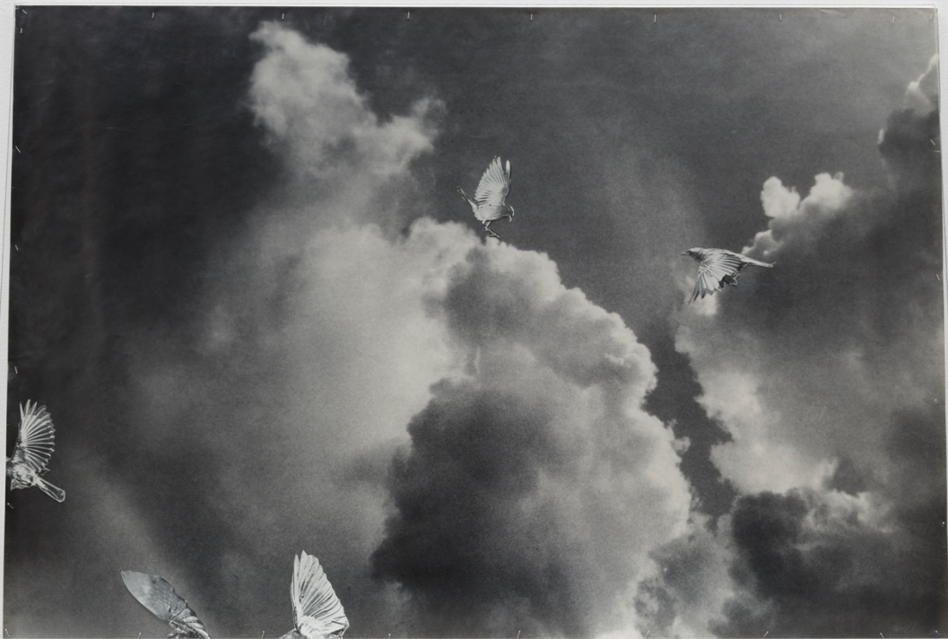
Iris Häussler Sky, 2024 Collage on Felix Gonzalez Torres poster from 1989, glas, reg 74 x 108 x 12 cm / 29 1/8 x 42 1/2 x 4 3/4 in IH/WO 5