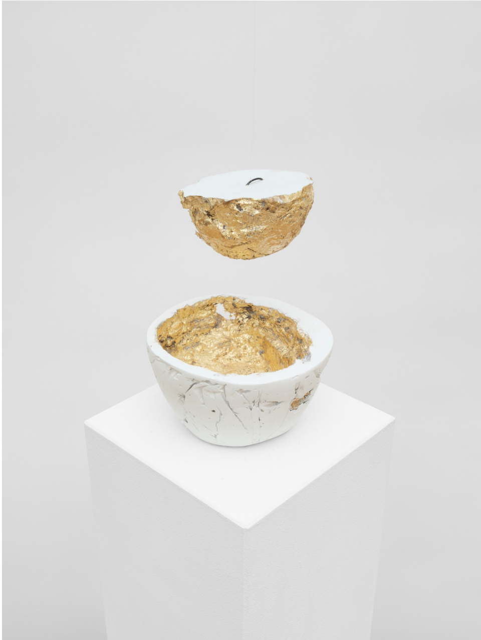
Iris Häussler Void, 2023 gip, blatt diameter 16cm; height 8cm diameter 10cm; height 6cm / diameter 16cm; height 8cm diameter 10cm; height 6cm IH/S 12