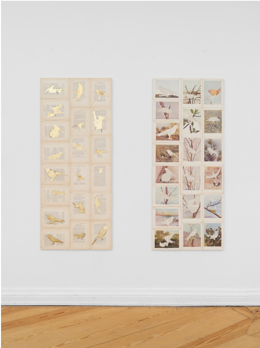
Iris Häussler Bird Neighbors, 2023 pap, nad, blatt 148 x 61 cm / 58 1/4 x 24 in IH/WO 4