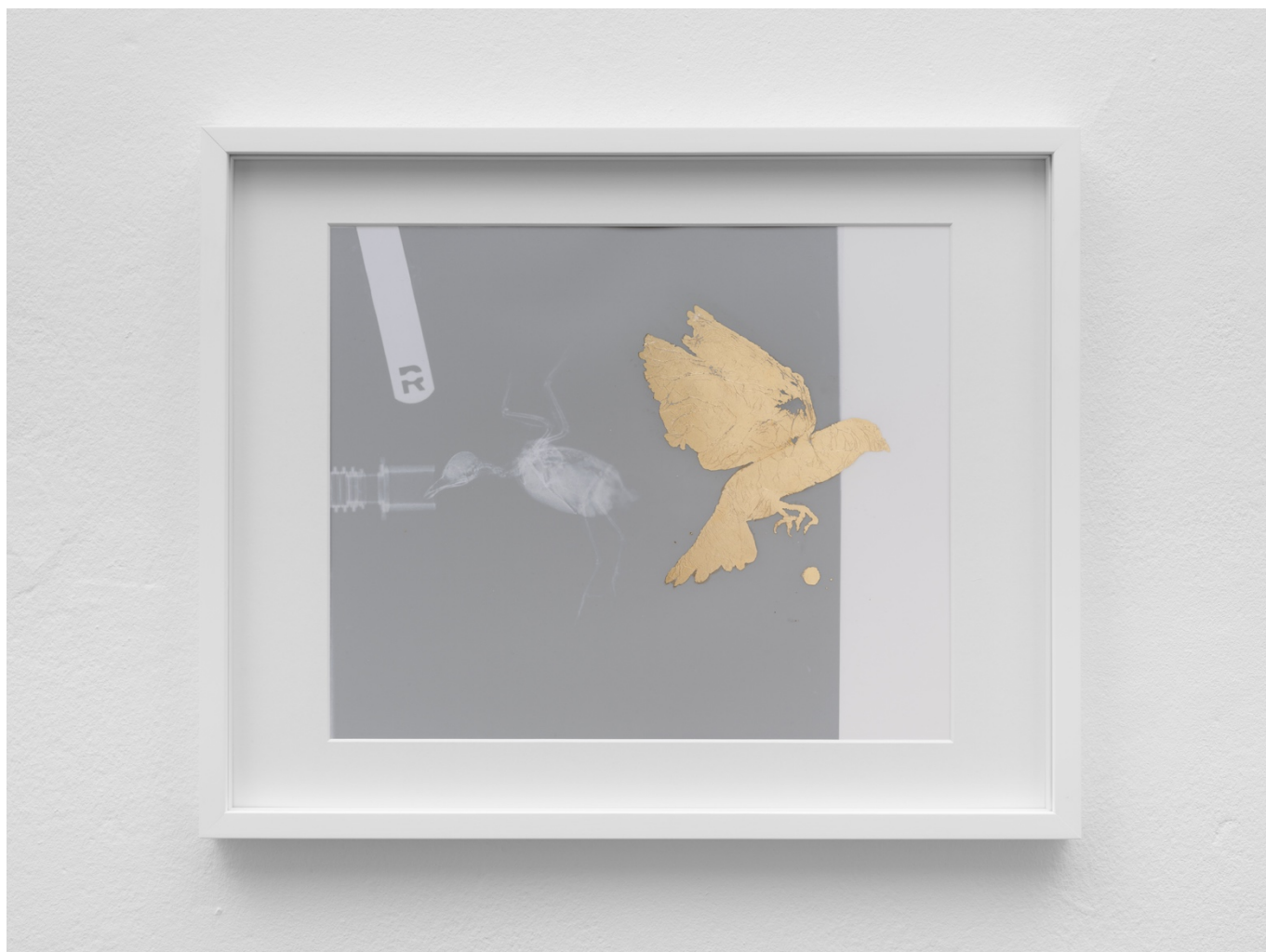
Iris Häussler Collisions, 2024 röntg, per, Bl 42,5 x 52 cm/16 3/4 x 20 1/2 in IH/C 4