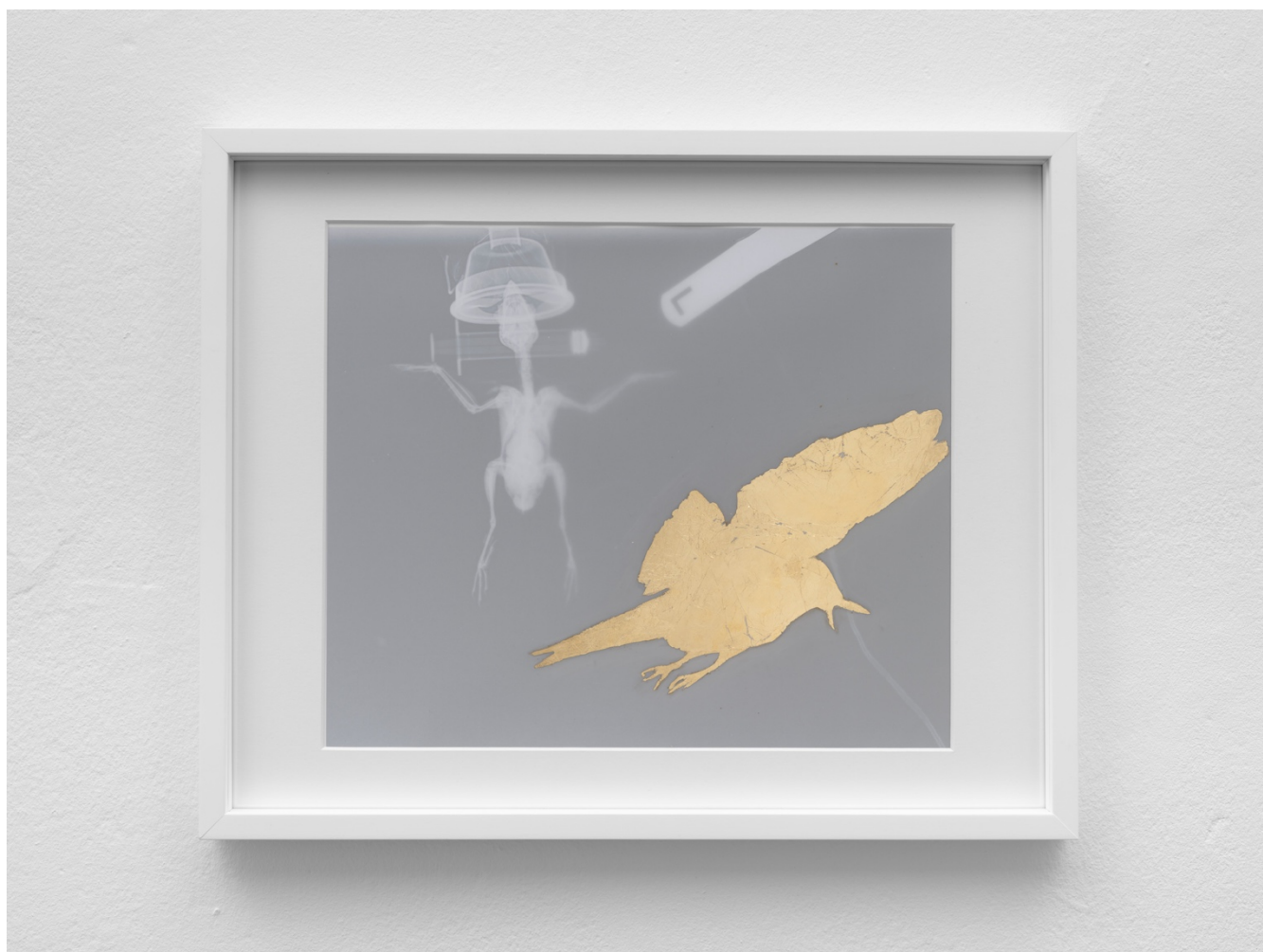
Iris Häussler Collisions, 2024 röntg, per, Bl 42,5 x 52 cm/16 3/4 x 20 1/2 in IH/C 5