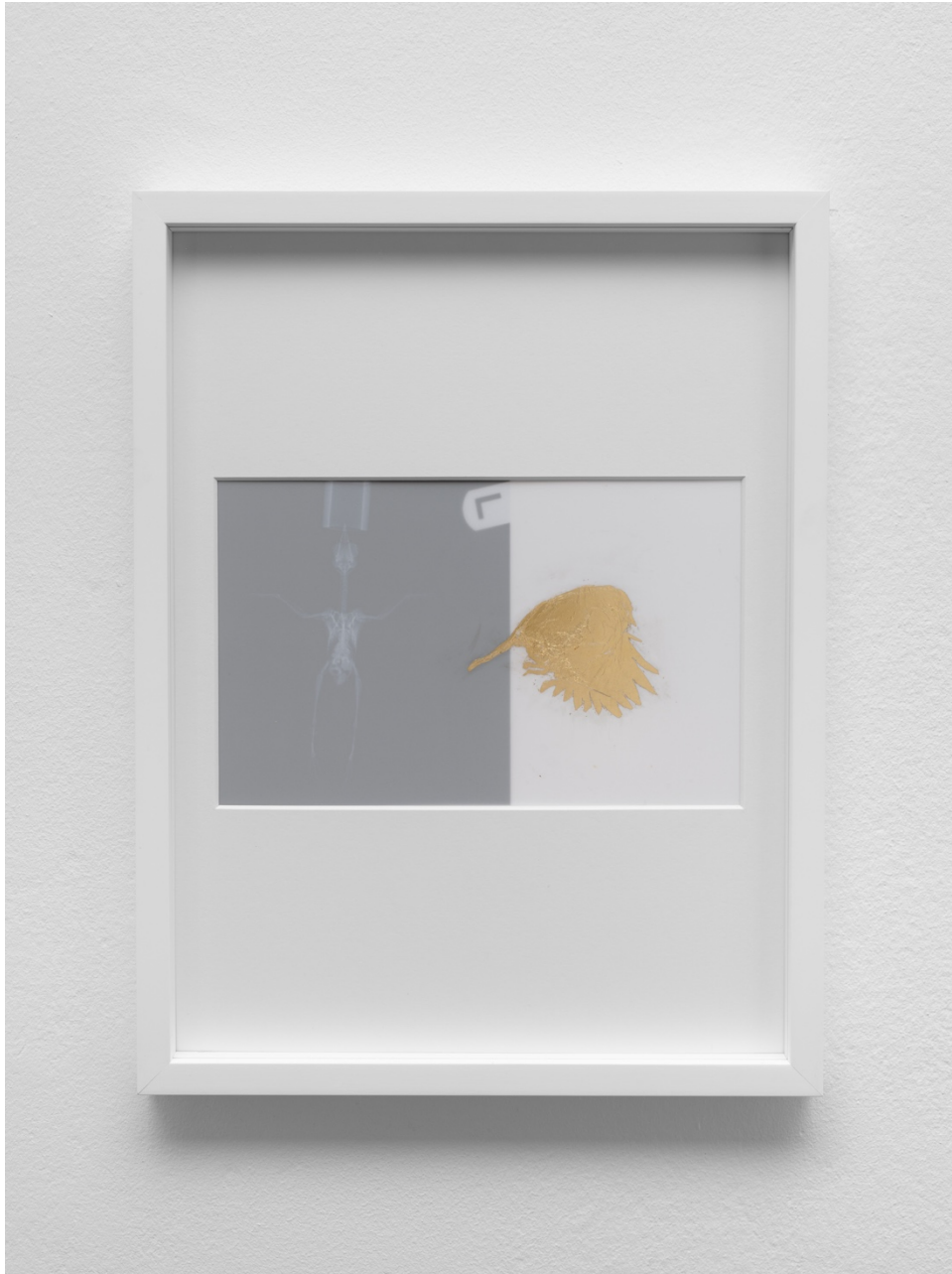
Iris Häussler Collisions, 2024 röntg, per, Bl 42,5 x 32 cm/16 3/4 x 12 5/8 in IH/C 7