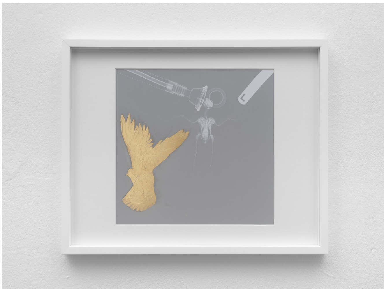
Iris Häussler Collisions, 2024 röntg, per, Bl 42,5 x 52 cm/16 3/4 x 20 1/2 in IH/C 1