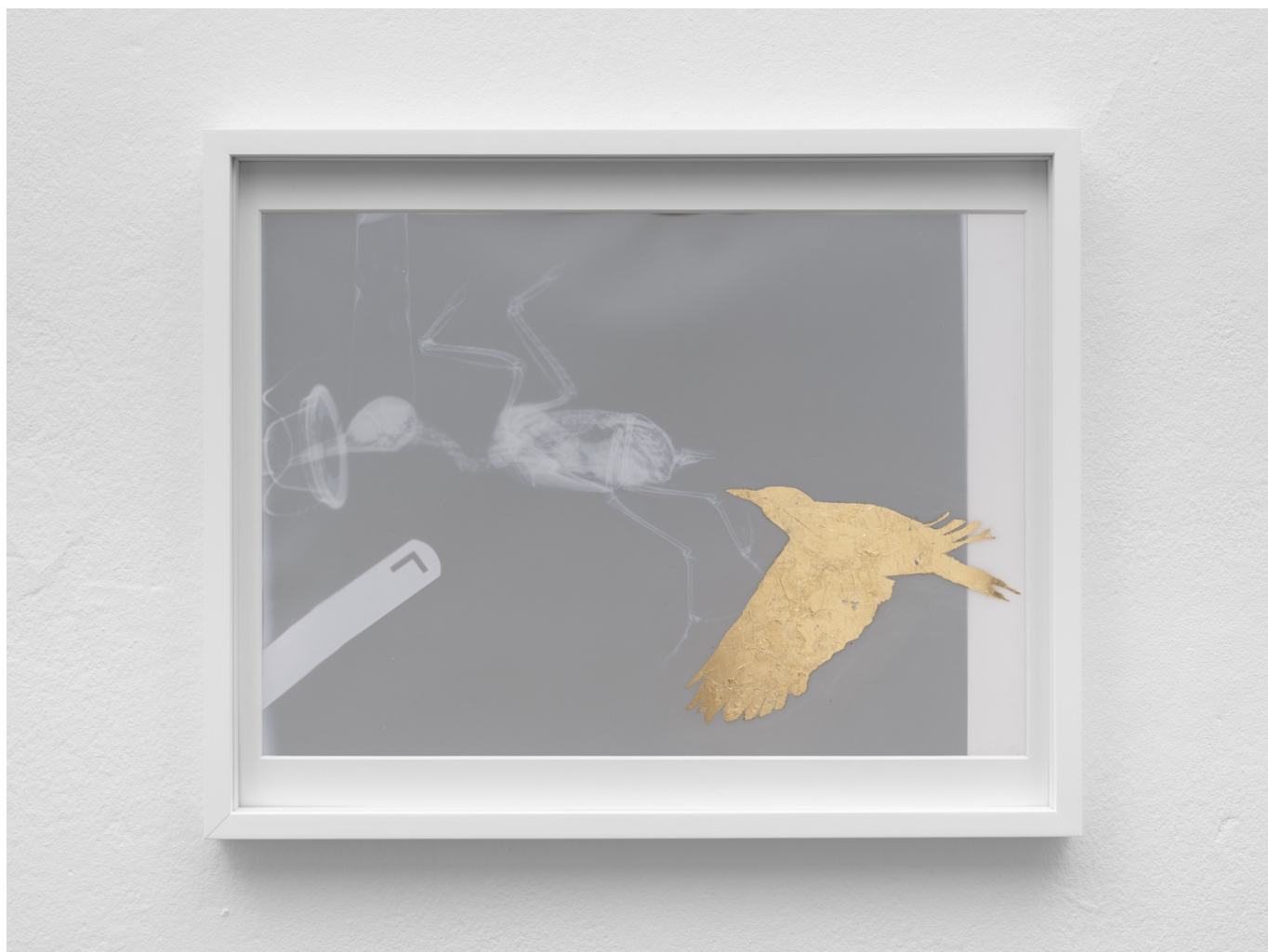
Iris Häussler Collisions, 2024 röntg, per, Bl 42,5 x 52 cm/16 3/4 x 20 1/2 in IH/C 2