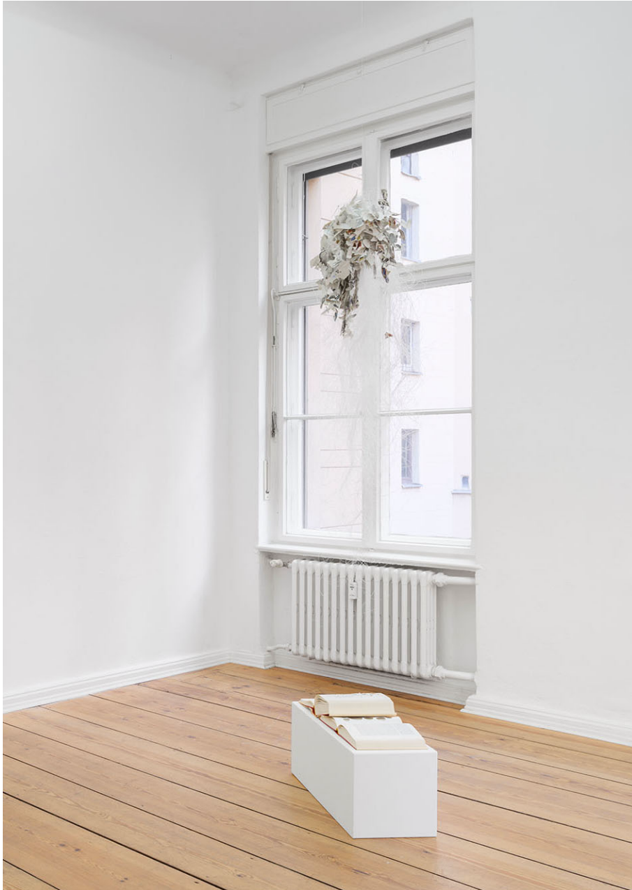
Iris Häussler Cluster, 2024 buch, ang, sockel h = 170, Ø 40 cm/h = 66 7/8, Ø 15 3/4 in IH/S 13