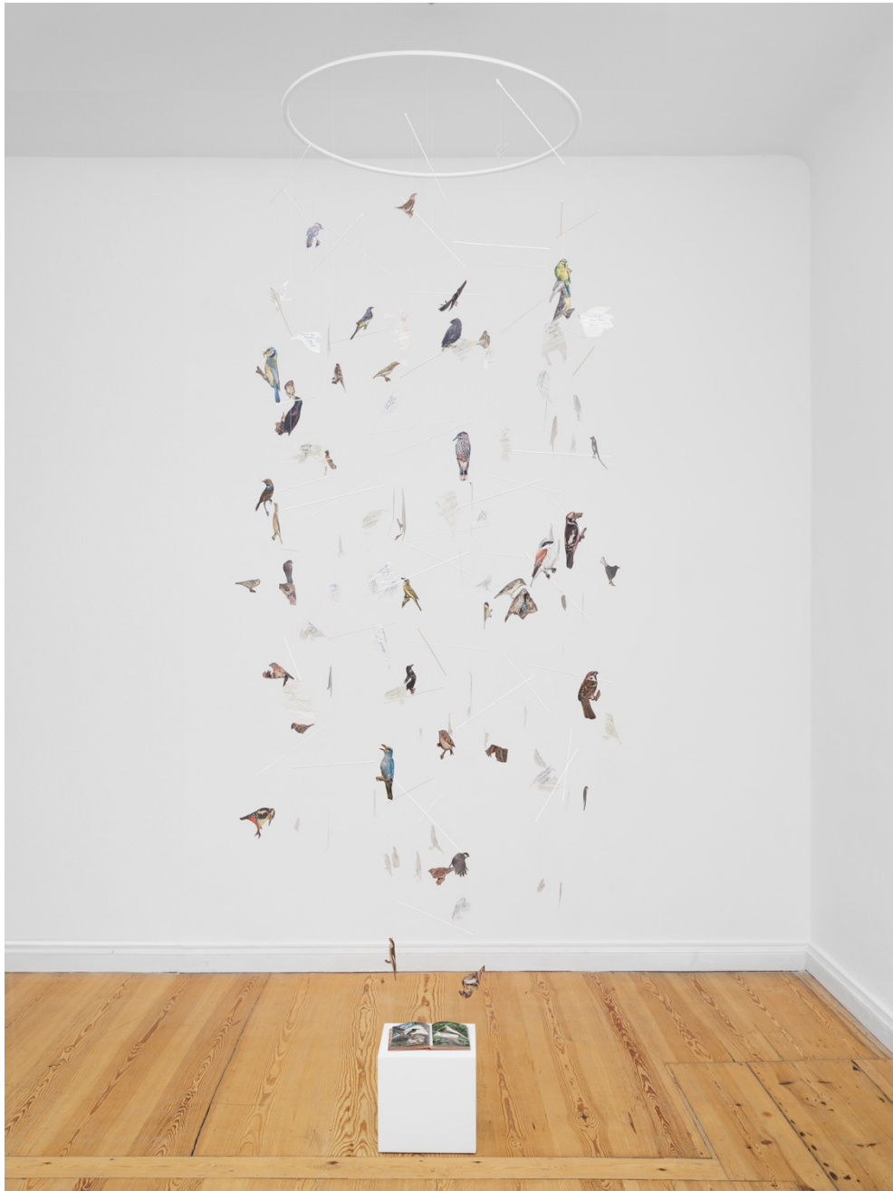
Iris Häussler Europäische Vögel, 2023 holz, ang, buch, sock h = 270, Ø 120 cm/h = 106 1/4, Ø 47 1/4 in IH/S 10