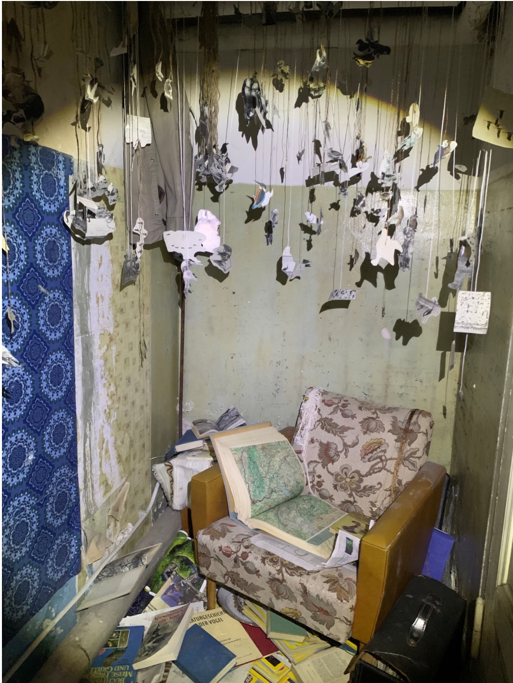
Iris Häussler Kurt's Den, 2024 Mixed media Format variabel / dimensions variable IH/I1