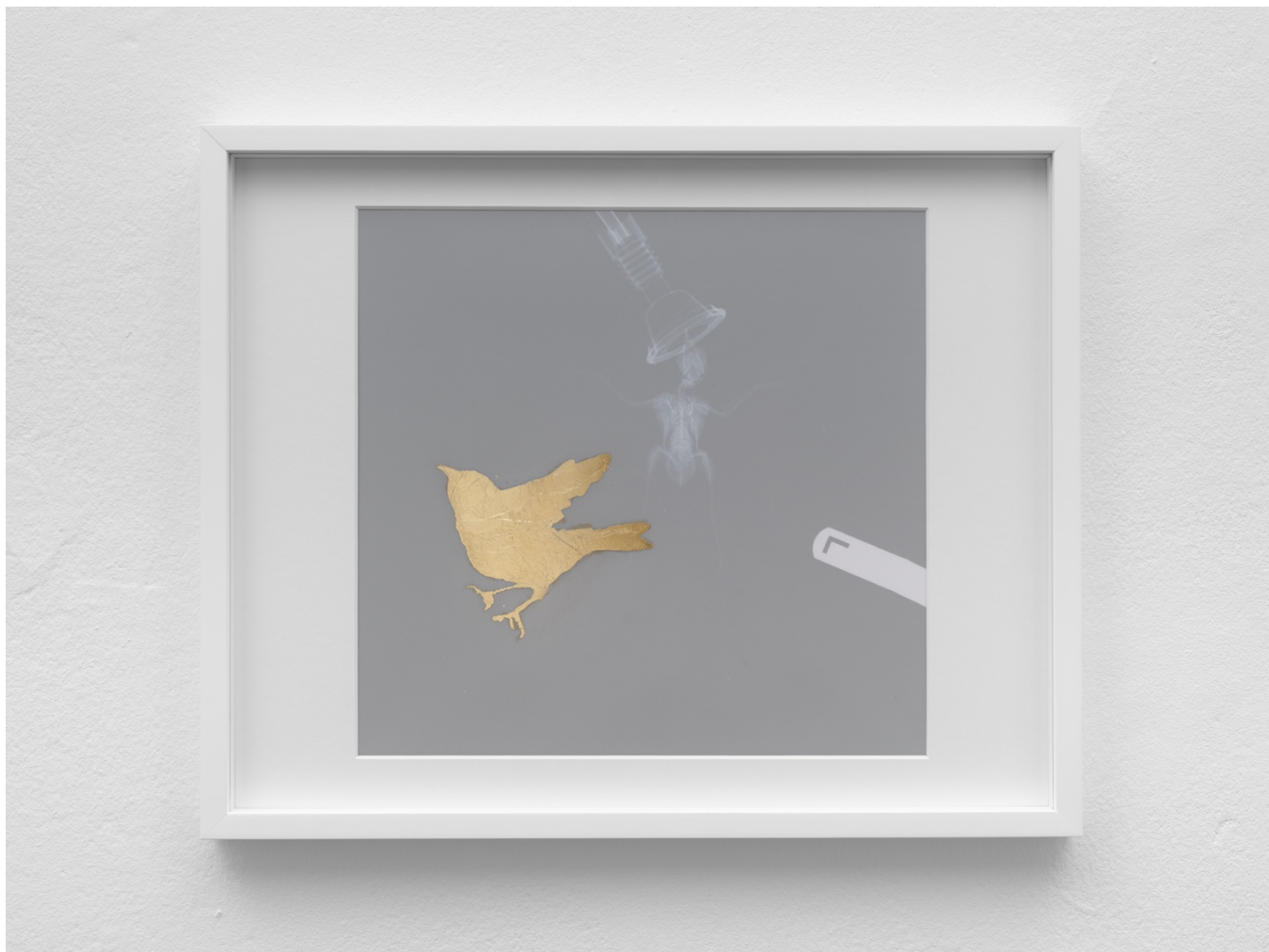
Iris Häussler Collisions, 2024 röntg, per, Bl 42,5 x 52 cm/16 3/4 x 20 1/2 in IH/C 3