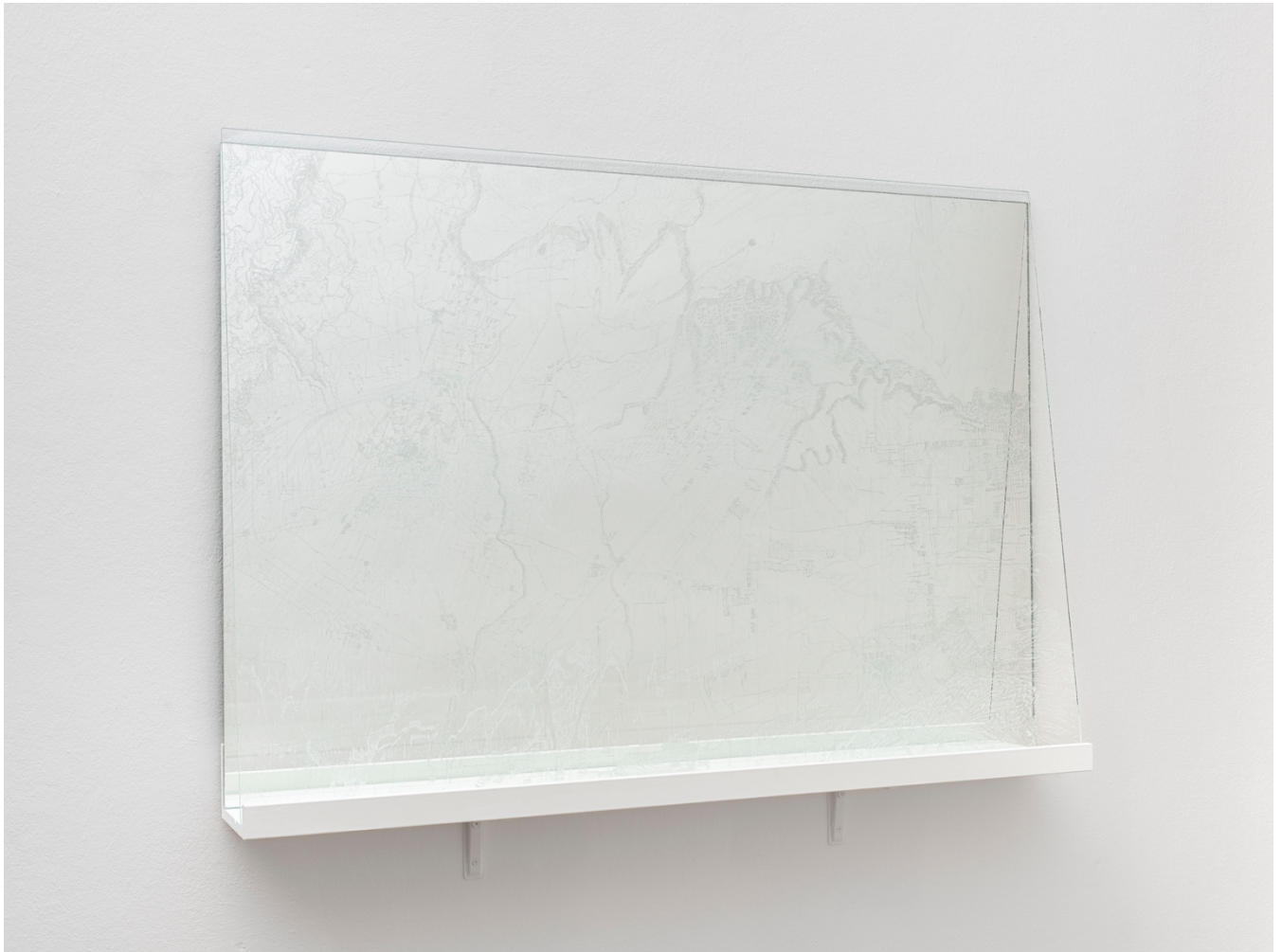
Iris Häussler Reflections II, 2024 spieg, glas, reg 65 x 92 x 12 cm / 25 5/8 x 36 1/4 x 4 3/4 in IH/WO 2