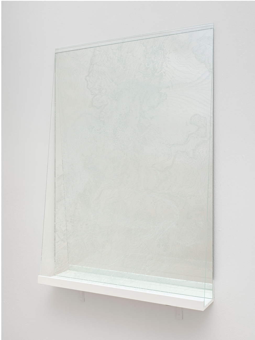
Iris Häussler Reflections I, 2024 spie, glas, reg 92 x 65 x 12 cm / 36 1/4 x 25 5/8 x 4 3/4 in IH/WO1