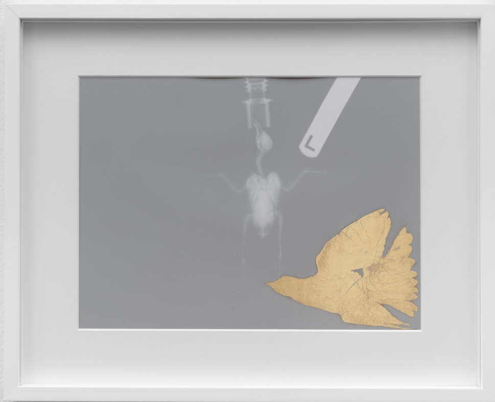
Iris Häussler Collisions, 2024 röntg, per, Bl 42,5 x 52 cm/16 3/4 x 20 1/2 in IH/C 6