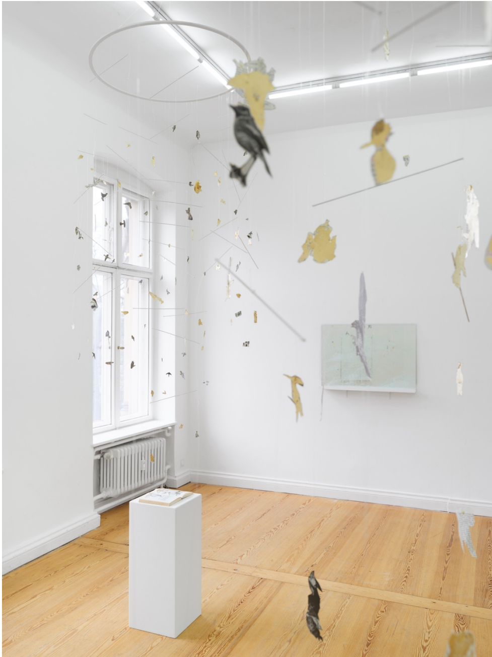
Iris Häussler Kosmosbuch der Vögel, 2023 FL, Holz, Sockel, B h = 215, Ø 110 cm/h = 84 5/8, Ø 43 1/4 in IH/S 9