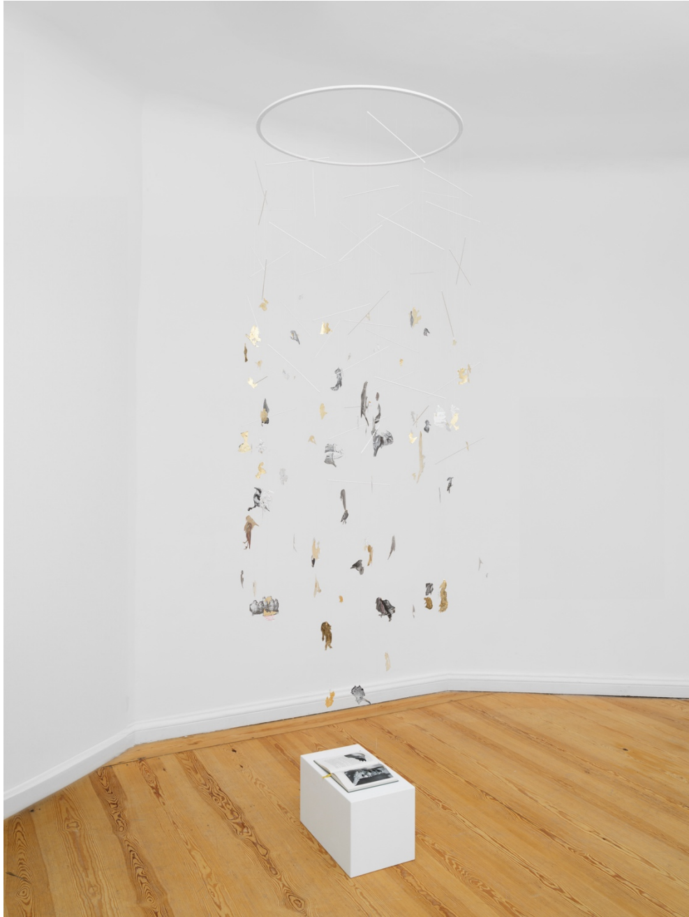
Iris Häussler Vögel vor der Kamera, 2024 ang, holz, sock, buch h = 270, Ø 115 cm/h = 106 1/4, Ø 45 1/4 in IH/S 11