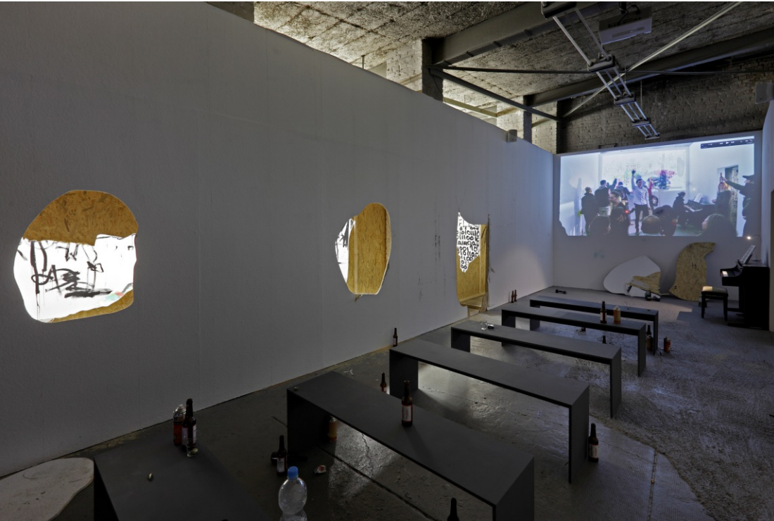
ELIXIR (2011) Performance, installation.

Installation views from PSM Gallery, Berlin.