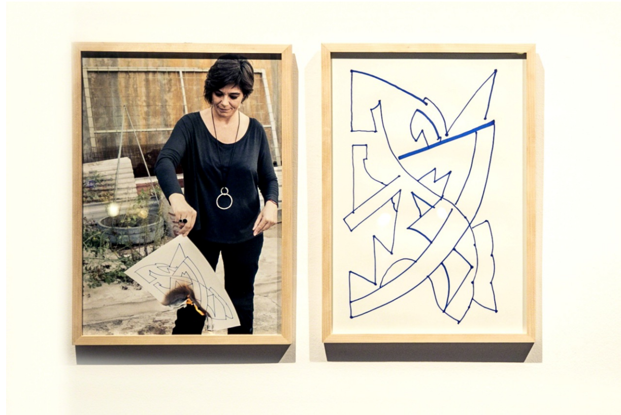
TIME/LINE/MOVEMENT, 2013 - ongoing Performance. Marker on paper, photograph, 2 parts, 42 x 39,8 cm each.

Time/Line/Movement is a series of drawings by Christian Falsnaes. Whenever one of these drawings changes hands the new owner must make a hand drawn copy of the original before burning it, making their interpretation the original.