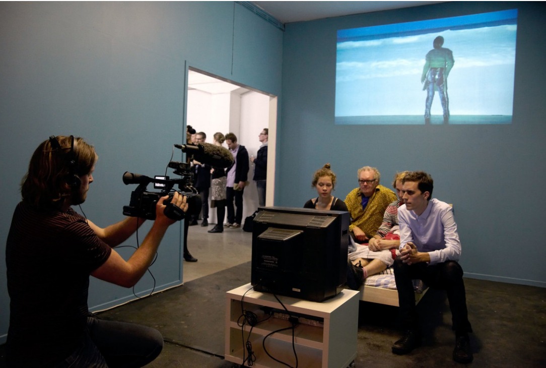
THERE AND BACK, 2010 Performance, installation, video.

Documentation from Skaanes Konstförening, Malmö.