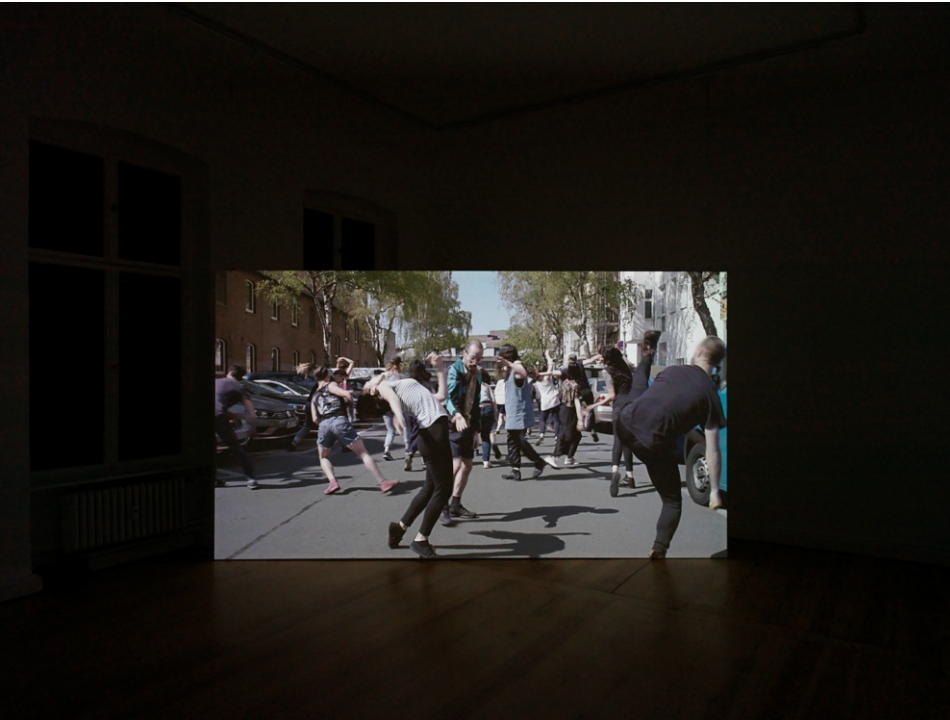
SELF, 2018 2-channel video installation.

Installation view and video still from PSM Gallery, Berlin. Video excerpt: https://www.youtube.com/watch?v=4yMjntBKKiA