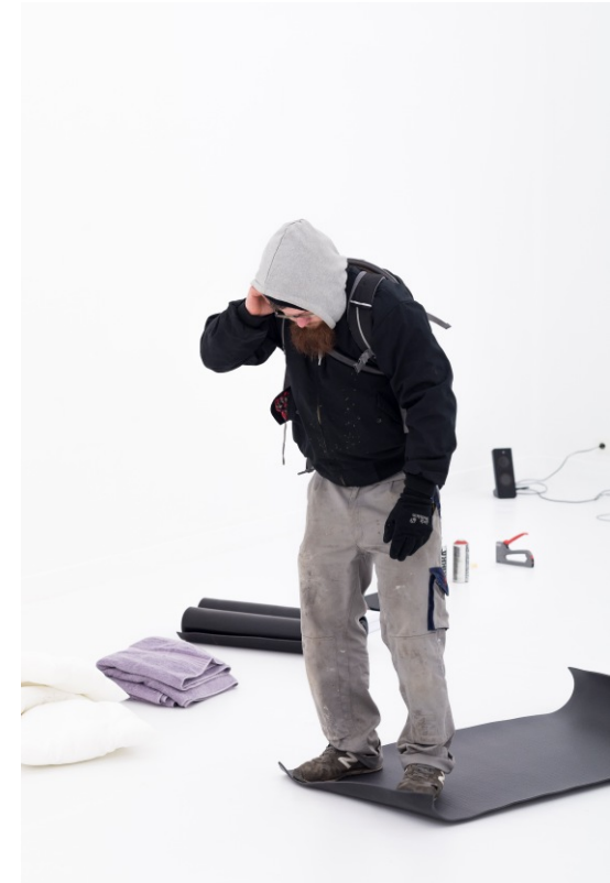
AVAILABLE, 2015 Mobile phone, visitors.

Whenever Available is shown, Christian Falsnaes agrees to the following conditions: Throughout the opening hours of the exhibition, visitors can call him and receive instructions for performances that they carry out. Every caller receives instructions for a personalized performance. Christian Falsnaes agrees to be available during the opening hours of the entire duration of the exhibition.