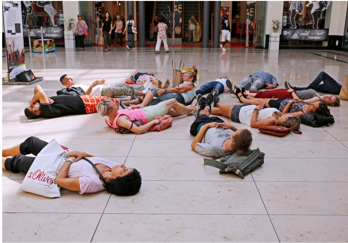
A voice continuously describes different situations evolving around social and physical interaction. An instructor is hired to make sure that the described situations are carried out by visitors.

Documentation from Kunstforeningen Gl. Strand, Copenhagen, 2016 and Postgalerie Karlsruhe (ZKM exhibition GLOBALE), 2015