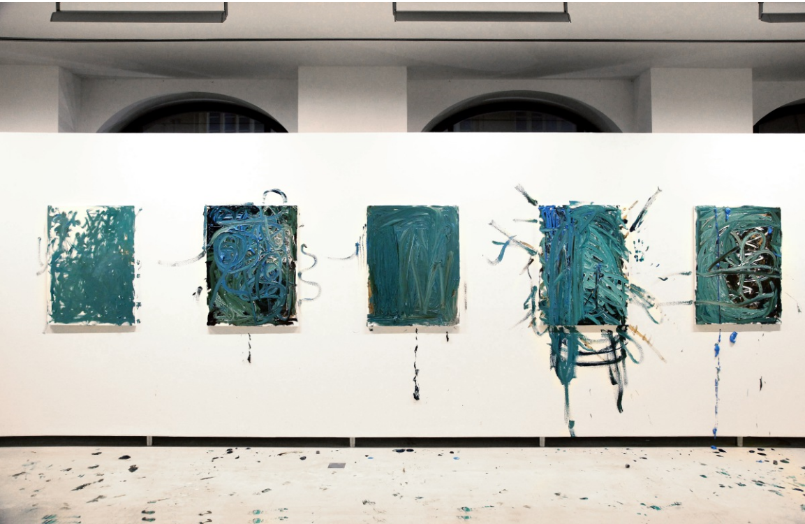
ONE, 2013 - ongoing Performance, oil on canvas.

Installation views from Galerie im Taxispalais, Innsbruck and Drei Galerie, Cologne.