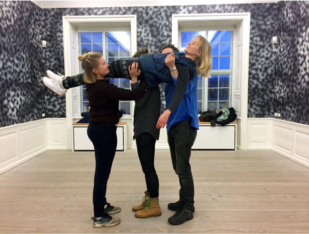
A GOOD REASON IS ONE THAT LOOKS LIKE ONE, 2015 Single channel audio on speakers, one hired instructor, visitors.

Documentation from Kunstforeningen Gl. Strand, Copenhagen, 2016 and Postgalerie Karlsruhe (ZKM exhibition GLOBALE), 2015