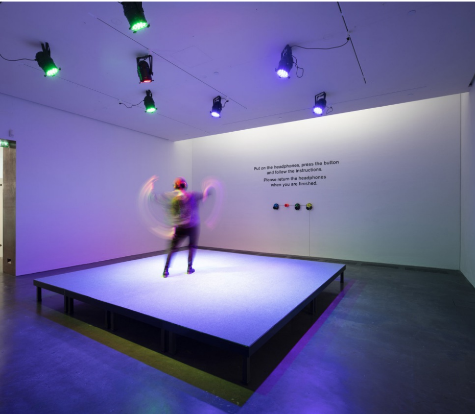
STAGE, 2017 Stage. Stage light. Audio on headphones. Visitors.

Installation views from Kiasma Museum for Contemporary Art, Helsinki, 2019.